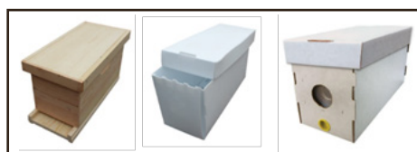
Figure 1 Nuc box options from left to right: a wooden nuc box, a plastic nuc box, and a cardboard nuc box

Additionally, the nuc should contain empty drawn comb to allow ready space for the queen to lay. A five frame nuc may contain one frame of foundation to provide the colony space to work and grow.