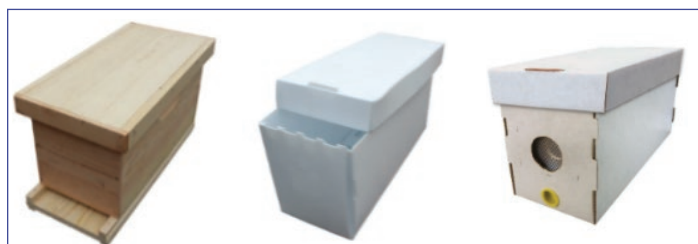
Figure 1: Nuc box options from left to right: a wooden nuc box, a plastic nuc box and a cardboard nuc box

Additionally, the nuc should contain empty drawn comb to allow ready space for the queen to lay. A five frame nuc may contain one frame of foundation to provide the colony space to work and grow.