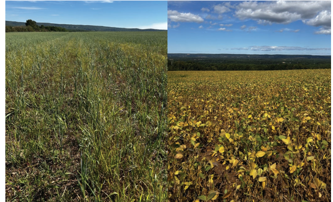
Figure 5: Drought stricken crops from August 2025 including oats (left) and soybeans (right).

Drought conditions: Lack of moisture will generally impact N cycling by slowing down processes rather than increasing losses or reducing inputs. The one exception to this is N fixation by legumes, where drought stress on the plants will reduce symbiotic N fixation more and more quickly than it affected the growth of the plants. Dry conditions will slow the mineralization of organic nitrogen but because soil conditions are generally aerobic during dry periods, the conversion of ammonium from mineralization to nitrate will not be reduced. The lack of moisture also means that leaching and denitrification are reduced so the mineral N that is produced will tend to stay there. Since drought reduces plant growth and therefore the N demand, we would not expect reduced N supply due to dry conditions to be a major limiting factor on crops. There may be circumstances, however, where delayed mineralization may mean an accumulation of nitrate in the soil after crops have finished taking up N, leading to an increased risk of N loss in the non-growing season.