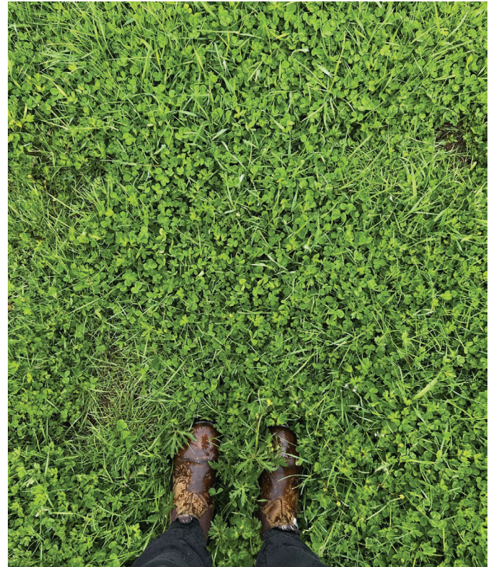
Figure 2: Clover and grass mix with plenty of moisture to fix nitrogen.

Symbiotic N fixation depends on the carbohydrates fixed during photosynthesis so any weather that reduces plant growth will reduce N fixation in the nodules. Drought stress in particular has an outsized impact on N fixation, both by reducing nodule formation and the efficiency of N fixation within the nodules while the plant is short of moisture (Serraj, Sinclair and Purcell, 1999). Perennial forage legumes will have the opportunity to compensate for this shortfall later in the season when soil moisture improves, but annual grain legumes like soybeans can suffer significant yield losses from dry conditions.