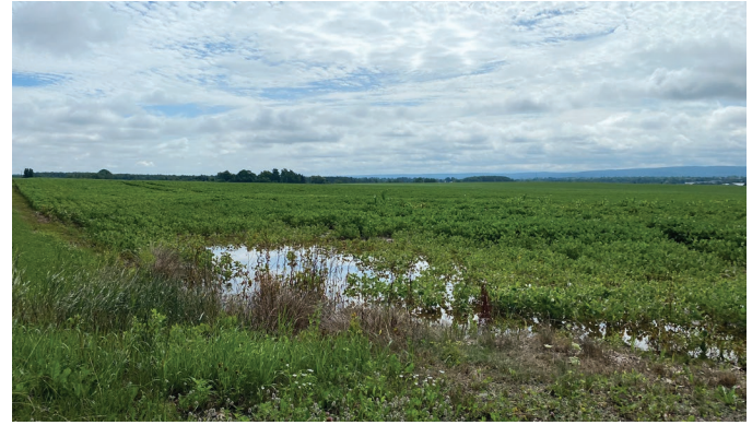
Figure 3: Waterlogged soybeans from excess water in Nova Scotia 2023. In this case, N is impacted by various biological, chemical and physical transformations including denitrification, leaching and runoff.

Nitrate can be mobilized from the surface of the soil into runoff water or picked up by water seeping through the soil that later moves to streams through tile drains or by lateral flow along an impervious layer. This transport pathway is episodic, occurring primarily during spring thaw or during large rain events in the summer.