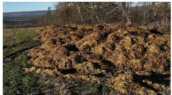
Figure 4: Fresh manure stockpile in a wet January field. A winter thaw with a warm and breezy day in January brings opportune time for ammonia volatilization for nitrogen. Both the left-over N in the moist field and the initial surface of the manure pile are susceptible.

Ammonia volatilization will be greatest when the soil is moist, humidity is high, temperatures are warm and there is a breeze. If urea or UAN solution is going to be surface applied (not incorporated or injected), it is best done when conditions are dry and cool, ideally when rain is expected to dissolve the fertilizer and carry it into the soil. Urea below the surface is largely protected from volatilization.