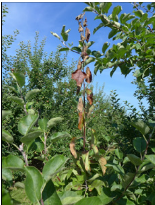
Figure 7: Later shoot blight symptoms of apple (see also Figure 6 on cover for early symptoms)