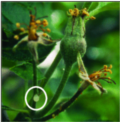
Figure 4: Blossom blight of apple. Note ooze droplet on pedicel.

Models have been developed to track the potential risk of blossom blight infections and can be used to properly time application of antibiotic products. One widely used model is Maryblyt (Figure 5). Maryblyt uses temperature data and phenological stages to predict the risk of fire blight infection and to predict disease symptom development. Be familiar with the use and interpretation of these models to best time antibiotic applications. It can be downloaded free at http://www.caf.wvu.edu/kearneysville/Maryblyt/ .