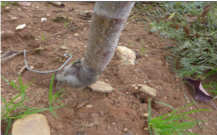
Figure 3: A young 'Ambrosia'/M.26 tree that is showing signs of discoloration of the graft union. This may be an indication of rootstock blight.