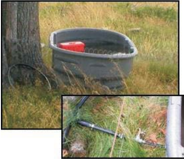
Picture 2: A pipeline system consists of a main line with connectors to tubs in paddocks

This is the preferred method of watering livestock in Nova Scotia. The source of water that normally feeds a pipeline system (Picture 2) is a drilled or dug well, however any other source can be used as long as there is electricity available for a pump to move the water. Wells can provide high volumes of quality water, are very reliable, and pipe can be laid out over a long distance, depending on the head.