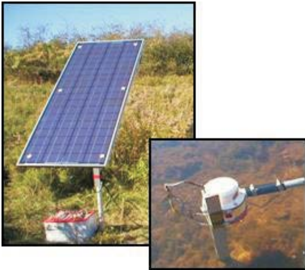
Picture 4: A simple set up of a solar panel, batteries and a submersible pump

Suppliers can help with the system design, including panel(s), batteries (optional), pump, controller and float switch. This system also has the potential to power an electric fence at the same time it is powering a water pump. Solar direct systems are at least double the cost of battery operated systems.