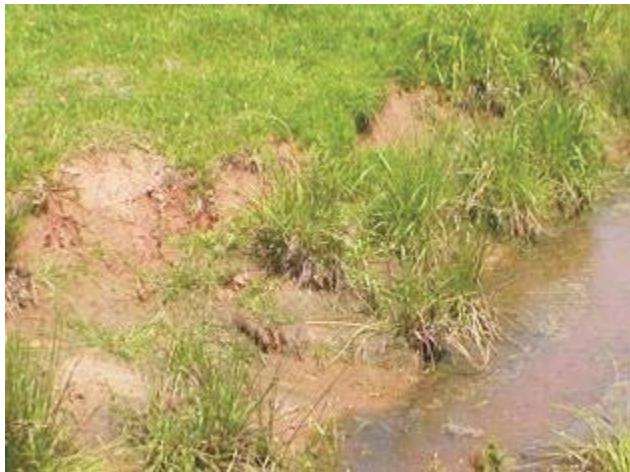
Picture 1: An example of a poor source of water; environmental degradation and a decrease in livestock production can occur

Impacts on livestock include reduced health, production, and rates of gain, and a greater chance of injuries. Impacts on the environment include erosion of banks, siltation of watercourses, loss of vegetation and habitat, nutrient build-up in water, and an increased growth of algae and bacteria, which can all have negative effects on aquatic life and water quality.