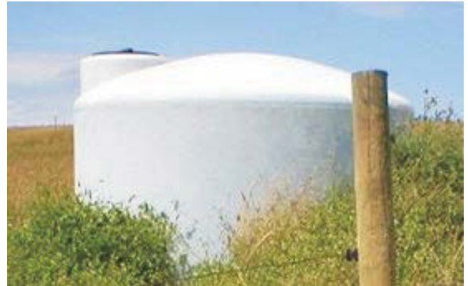
Picture 7: Typical tank used to haul and store water in more remote areas

There are many types of pumps that can be run by portable batteries or gas engines. They are useful as backup power sources or when providing water in remote areas. However these can be more labour intensive as the power source needs to be attended to regularly. Theft may also become an issue.