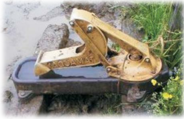
Picture 6: It is preferable to place a pad underneath the nose pump to avoid a mucky drinking area