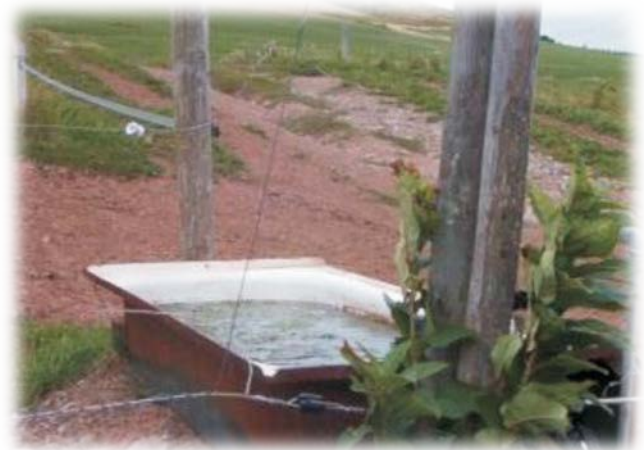
Picture 3: A gravity flow system with source feeding waterline at top of hill and delivered at water tub

The pipeline should be as straight and level as possible to prevent air locks, but the risk of air locks increases as distance increases. The diameter of the waterline should be at least 1.25 inches (3.175 cm) for grades over one percent, but if pressure drop is a problem, then up to 1 ¾ inches (4.45 cm) diameter may be required. The daily volume is completely dependent on the source (i.e., flow from spring or volume of pond).