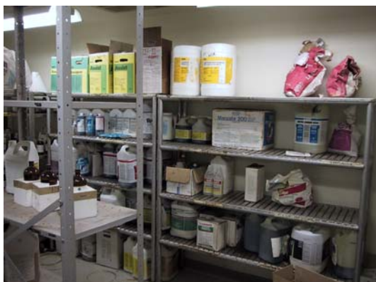
Figure 4: Shelving and Organization