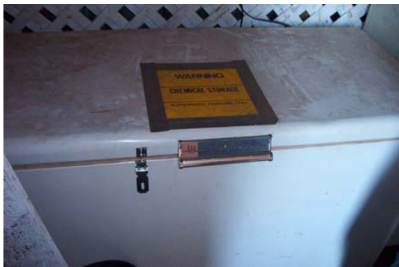
Figure 1: Freezer Storage

When a farm stores small quantities of pesticides (less than 25 L in liquid form or 25 kg in solid form), an old household freezer will provide adequate storage (Figure 1).