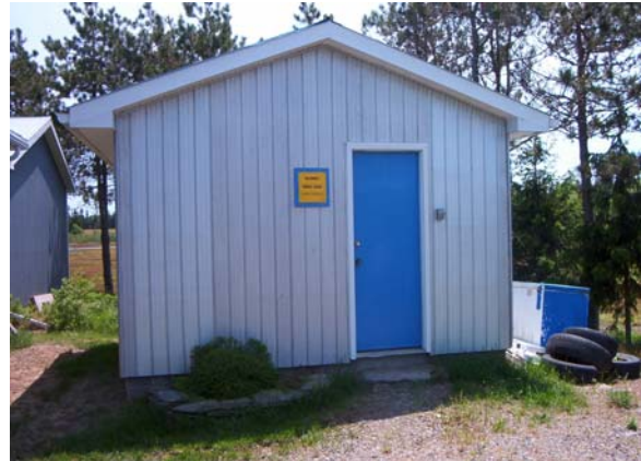
Figure 2: Pesticide Storage Building

When large quantities of pesticides are stored, a separate storage facility should be constructed (Figure 2).