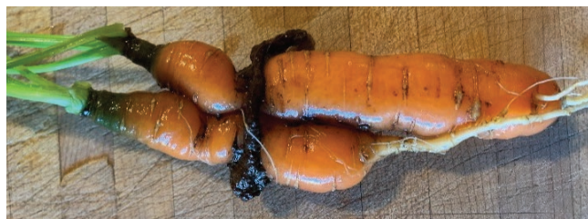
Figure 2. Example of a foreign object that should have been excluded from compost that has created problems for food crops.

This is the inorganic stuff that gets into the compost but won't break down in the soil (plastic, glass, metal, etc.), some of which might be sharp enough to cause injury or puncture tires. Category A compost should not have any sharp foreign matter greater than 3 mm per 500 mL sample. Neither should it have more than one piece of foreign matter greater than 25 mm per 500 mL.